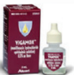
Vigamox/Moxifloxacin or Zymaxid/Gatifloxacin